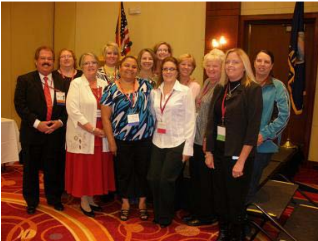
Board Members & Trustees